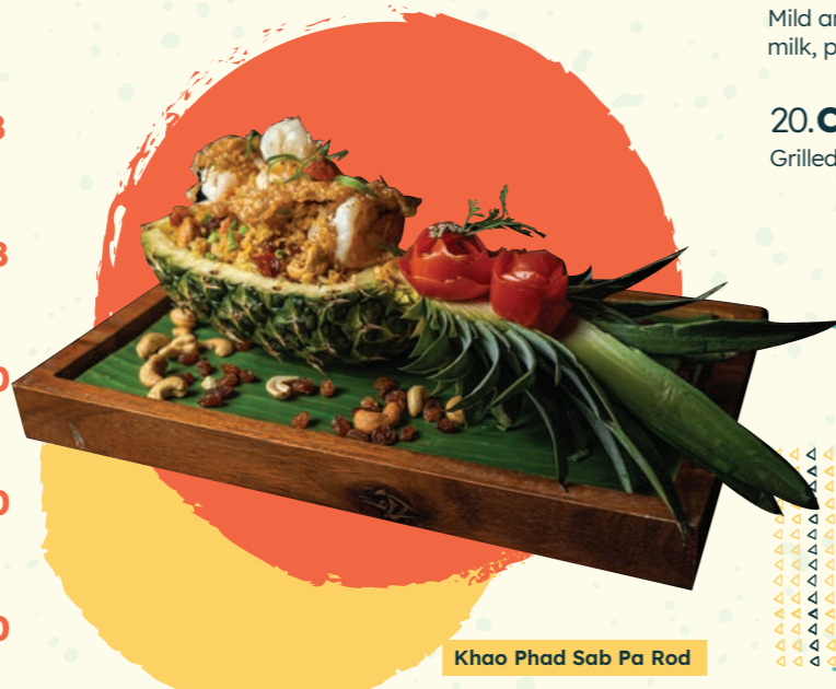
Khao Phad Sab Pa Rod