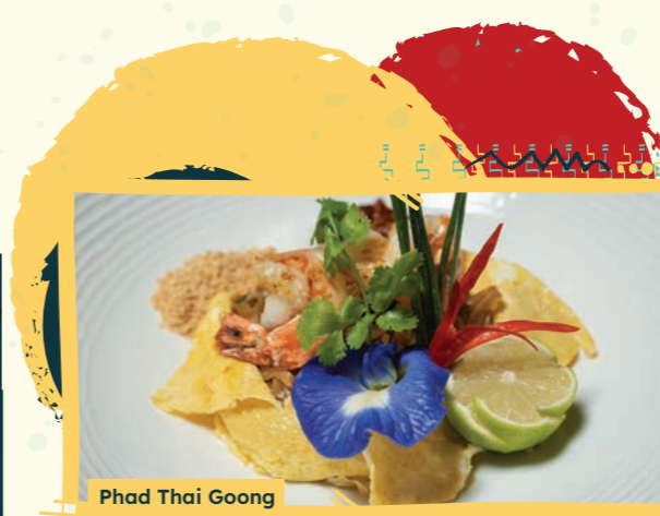
Phad Thai Goong