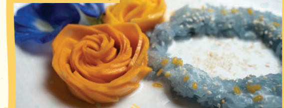
Khao Niaw Mamuang