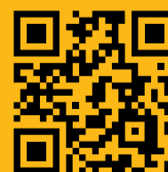
HOW TO CLEAN A CRAB

Please ask for our fingerbowl, a delicate combination of Ceylon tea (which serves to cut oiliness) Venivel (a traditional Ayurvedic disinfectant) and fragrant Iramusu flowers sourced from Sri Lanka.